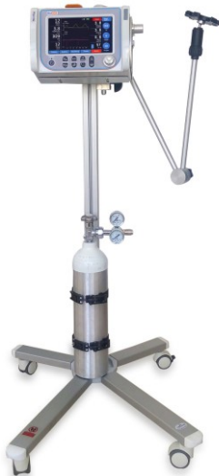
Ventilator Cart with tube holder