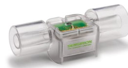
Neonatal Flow Sensor